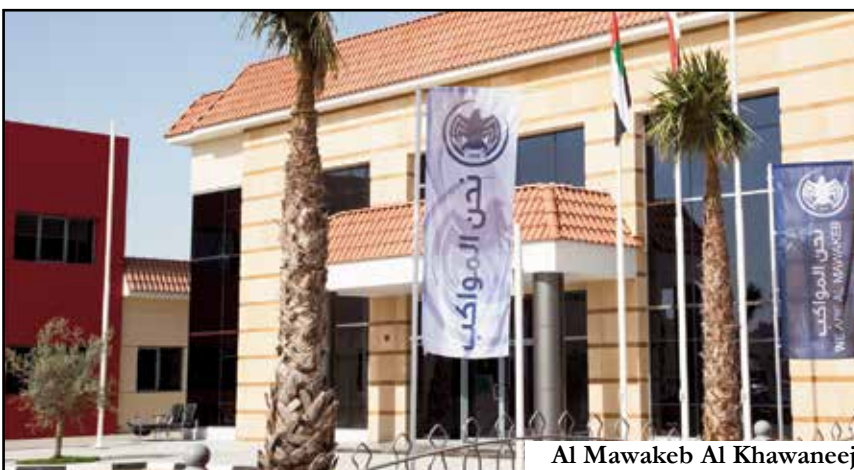
Al Mawakeb Al Khawaneej

Al Mawakeb schools are managed by AMSI and provide a comprehensive university preparatory education to students of all backgrounds and nationalities.