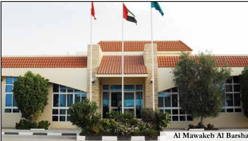
Al Mawakeb Al Barsha