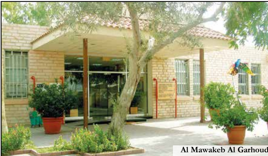
Al Mawakeb Al Garhoud